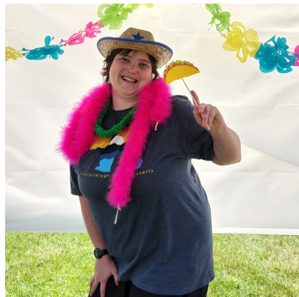
Rutland Mental Health Services Community Care Network Developmental Services picnic