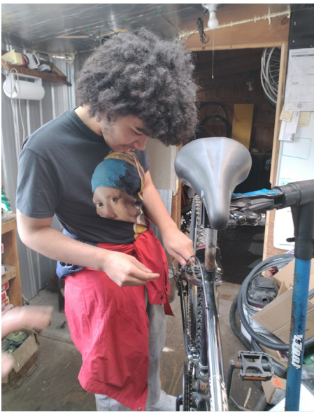
UCS JOBS client works at local bike shop learning to repair bikes