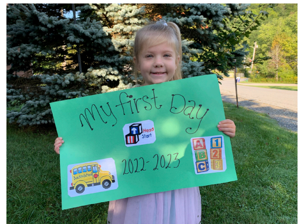
UCS Head Start first day of school

“My service provider seems to know and understand what my needs are and there is always someone to reach out to both my child and myself.”